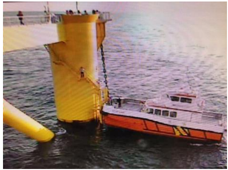
Figure 3. The catamaran boat 'J CAT ONE'

To improve accessibility to the turbines and the sub-station, we have been started to charter catamaran offshore support boat as a transfer vessel since December 2013. It provides more reliable, safer and effective access to the floater. The measuring instruments on boat also help to evaluate the sea condition.