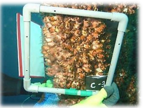
Figure 5. Seashells sticking with chains