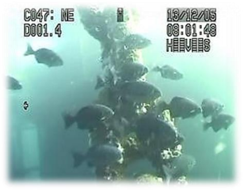
Figure 4. Fish gathering, by ROV

To ensure the fish gathering effect, which is said that fish is tend to be drawn to floater, the undersea condition around facilities is observed by ROV. Materials stuck with the floater, which may impact fish gathering, is also investigated. Seashells are found sticking with the chains a month after installation of facilities and some fish are found to migrate around the chains and sit near the anchors.